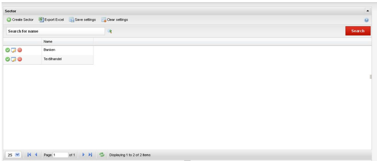
Table of industries

In the menu System > Master Data > Industries you finally get a list with the branches and industrial sectors.