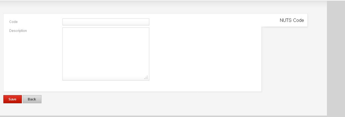
Form to edit and configure NUTS - Codes